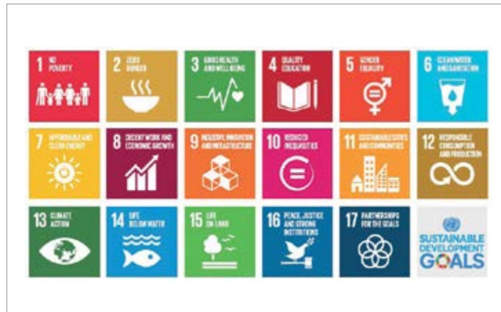
Fig. 2: UN Sustainability Development Goals (SDGs).

worked to broaden the understanding of sustainability, recognizing it as a comprehensive framework that extends well beyond greenhouse gas reductions.